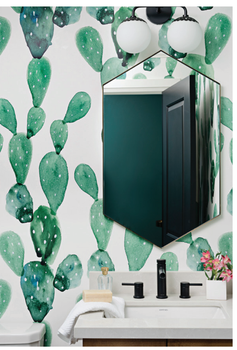
Left – Design: Rebecca Hay Right – Design: Cynthia Soda

Crisp lines are complemented by a round porcelain sink and patterned tile flooring in this classic, contemporary powder room. The natural wood and exposed pipes create a cool, minimalistic style, and the intricate tile grounds the vanity.