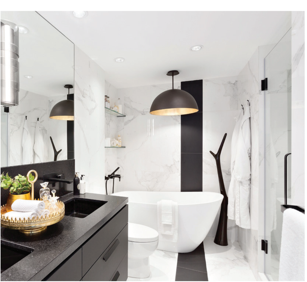
Design: Kalu Interiors

Modern design takes a new approach when thoughtfully mixed with natural and semi-precious stones. This classic black-and-white palette is the perfect mix of modern, industrial, and chic. The addition of gold embellishments brings warmth and delicacy to this timeless design.